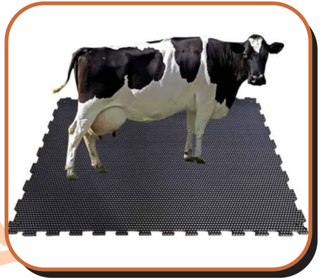
Stable Mat / Cow Mat