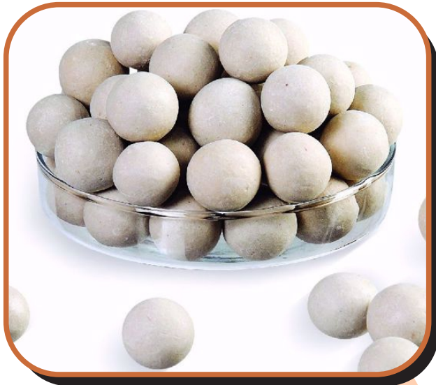
Inert Ceramic Balls